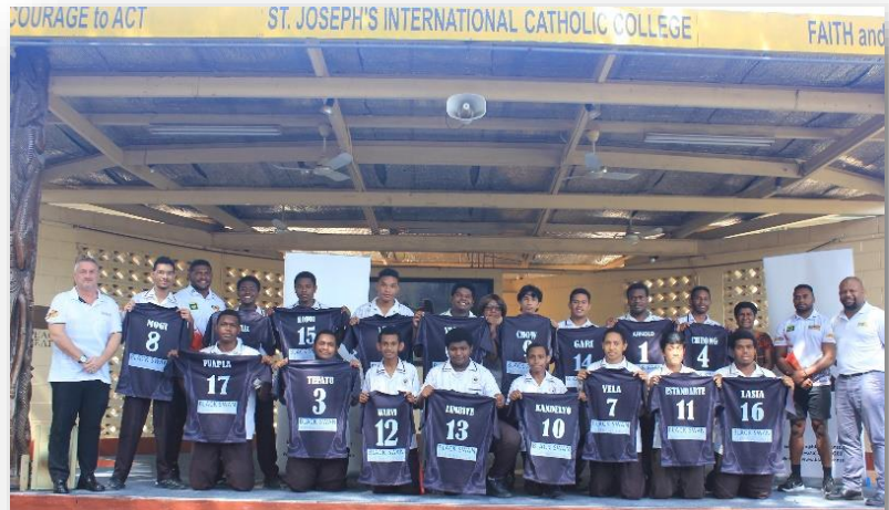
BSI Management and SP Hunters presenting the rugby jerseys to Kings Rugby Union Team.

Black Swan International was honored to be part of such an event, where young future generations of the country are being mentally and physically active and we recognize that Rugby Union is not just a sport but more than that. It is a force of inspiration to the young generation of PNG.